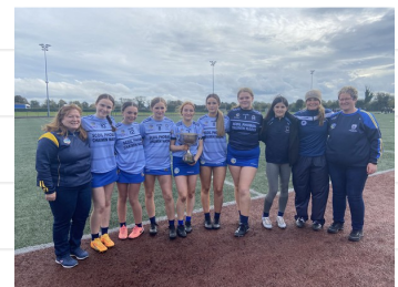
Team and Management