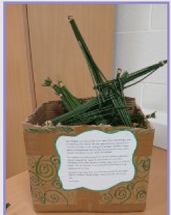
Box of crosses given to teachers and other staff members on St. Brigid's Day

One of our student's busy making a St. Brigid's Cross