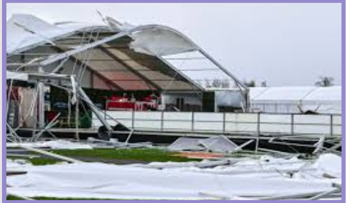
Blanchardstown's ice rink.