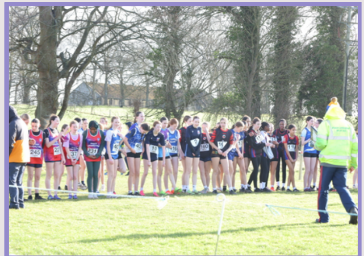
All participants at the starting line

Our Senior Girls took home team bronze medals and secured their place in Munsters. Well Done Everyone!