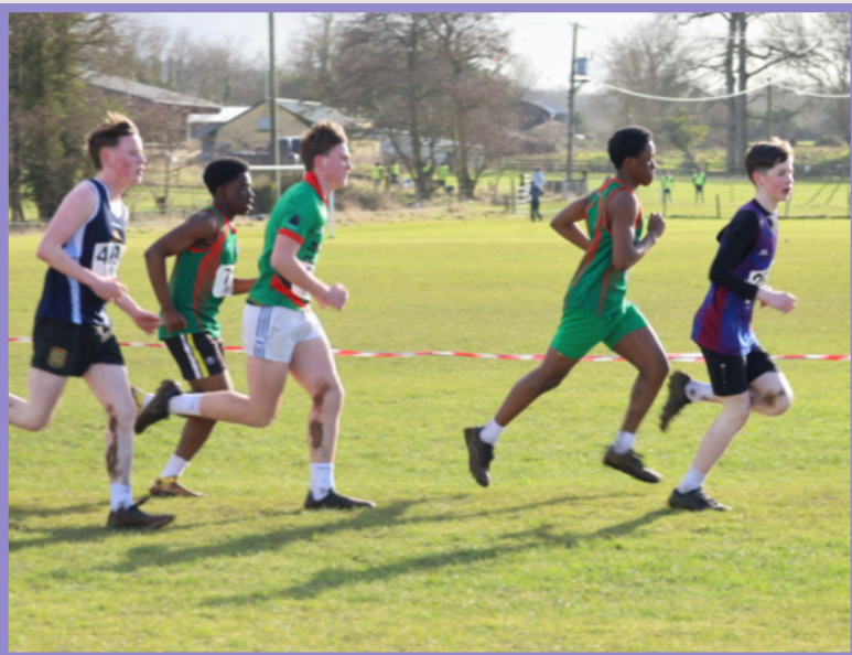
Students in action at Cross Country