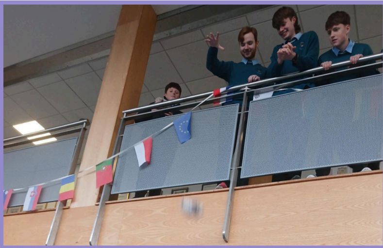
Students dropping their eggs from the balcony