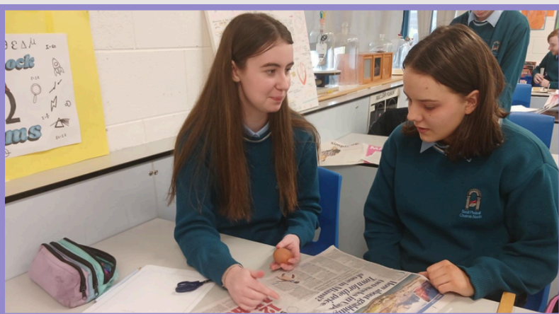
Students discussing and creating their contraptions