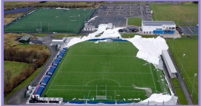
Connacht GAA Air Dome

The storm left a trail of destruction across Ireland damaging places such as the Connacht GAA Air Dome and Blanchardstown's ice rink.