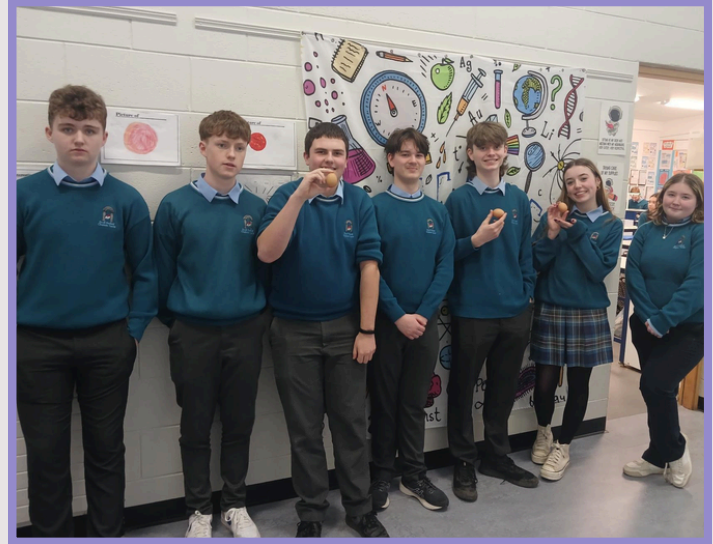
Students posing with their eggs

Everyone was given around 20-25 minutes to create their own contraption. Each contraption was very unique and everyone managed to complete it in the given time and make a great attempt. Some eggs did in fact crack when dropped from the balcony upstairs but many groups were able to successfully drop their eggs down without cracking. It seemed that the best way for the egg not to crack was to do a parachute for the egg.