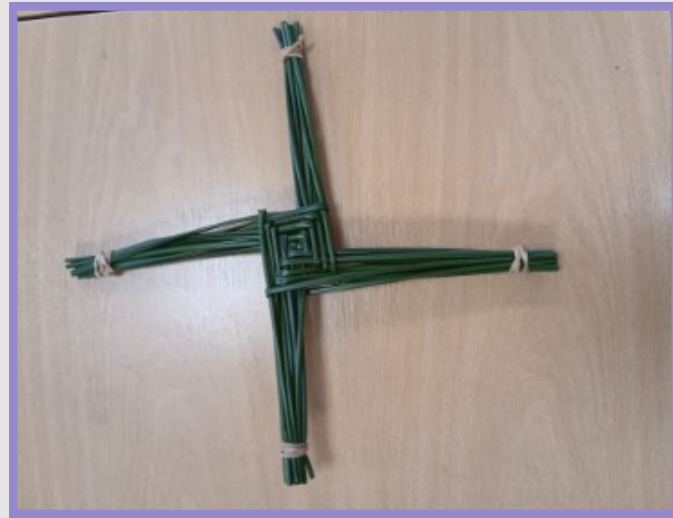
A picture of a St. Brigid's cross.

The first St. Brigid's cross was made by St. Brigid. She was visiting a dying chieftain, and she picked some rushes off the ground and weaved them into the first St. Brigid's cross. She then explained the story of Jesus and all of Jesus's teachings to him. Before the chieftain died, he had become a Christian.