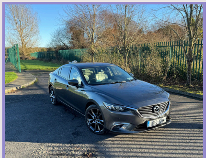
Washed car done by the lads

The lads' car detailing consists of waxing the exterior of the cars, cleaning out the inside of the car if it's dirty which would be done by using a vacuum especially for the carpets. Their job also consists of washing the exterior of the car, detailing the interior, wiping down the trim and the dashboard as well. To add to that, they also wash the exterior of the car too if needed and then let it dry out for a while.