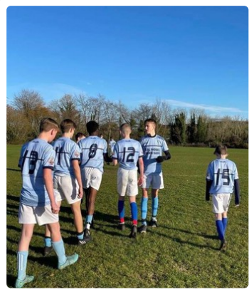
Victory for the Under 15 boys