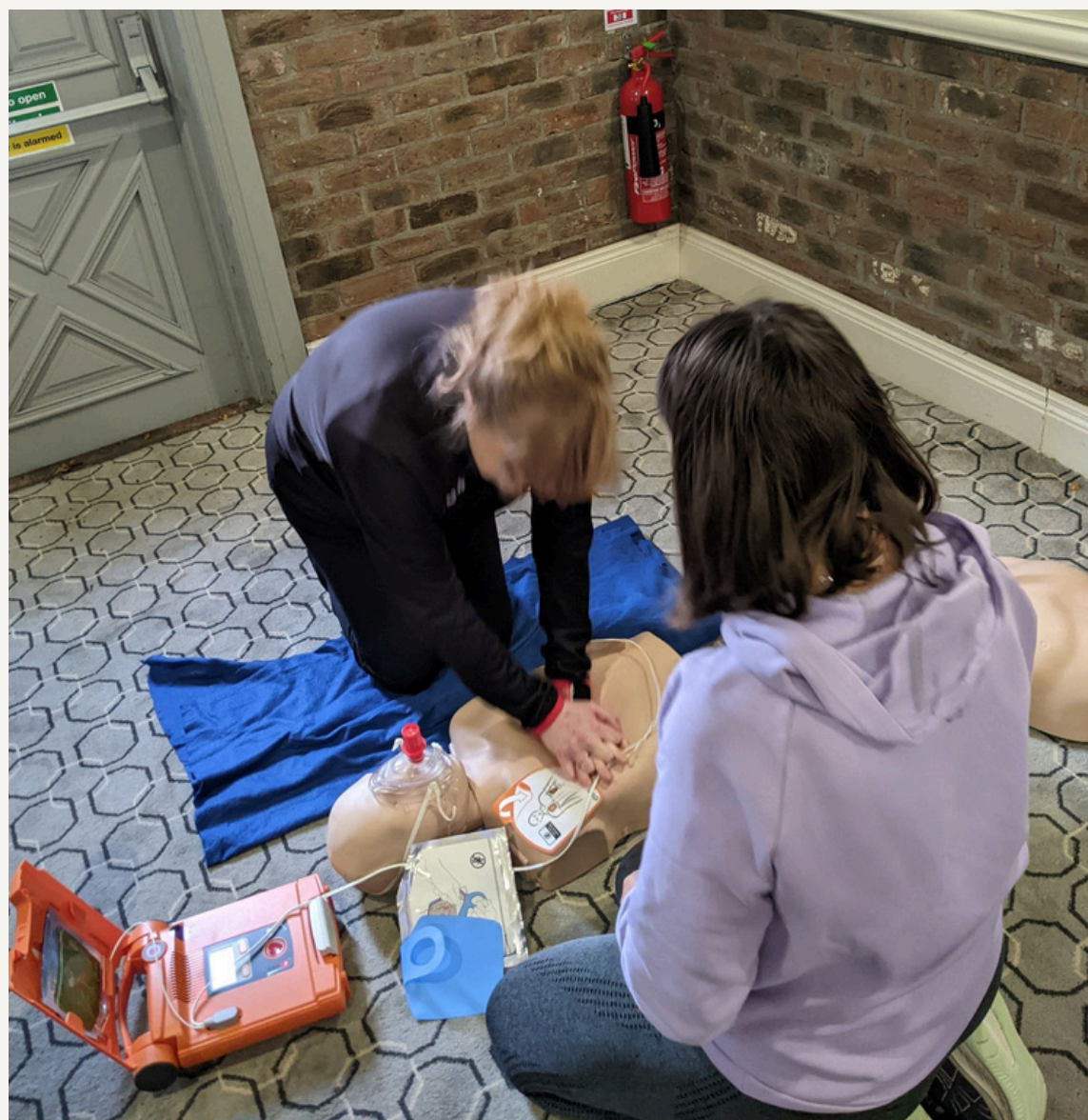
This is us practicing how to do CPR and using a training AED.

AVPU stands for Alert, Voice, Pain, Unresponsive.